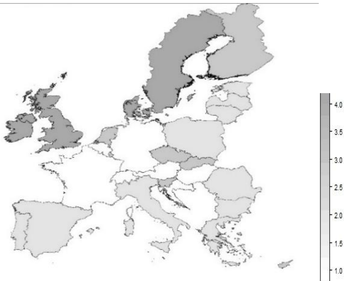
Figure 2. Cluster map EU-28